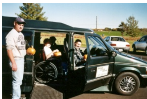
The van for those fun outings

Back view of home, and view from back porch where deer and wild turkeys are often seen. A cheerful setting . . .