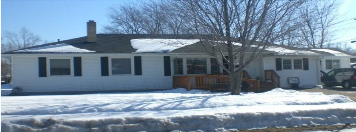
Assisted Living CBRF 2005 Agnes St Eau Claire, WI 54701 715-832-3663